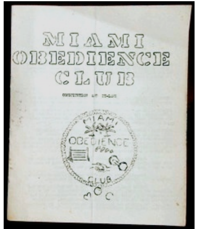
The Cover of the Original MOC Constitution with Hand Drawn Logo

Undoubtedly those who were MOC Members in 1982 had good reasons at the time to make the changes to the Constitution that they did. It all serves as a reminder that the needs and the circumstances of the Club do indeed change from time to time.