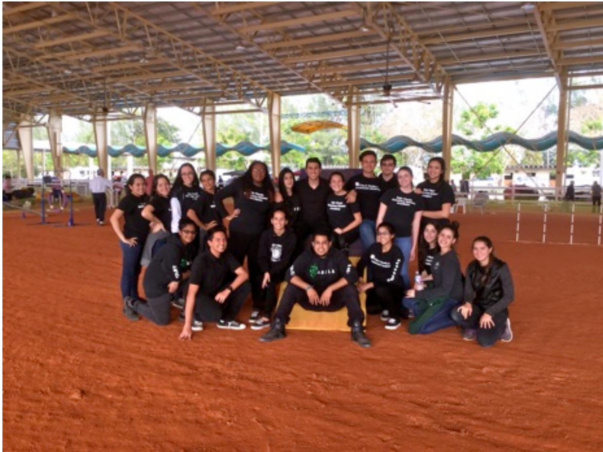
The young men and women volunteers of Felix Varela High School

At our January Agility Trial, MOC was once again fortunate to have the assistance of volunteers from Felix Varela High School during the weekend. The Scooper asked the students if they would write a Behind the Scenes article explaining the organization and operation of their volunteer team. Two students went to work and their article appears on the next page. These young men and women are our future. They get up very early and give up a precious weekend to come to our trials and help out. They are a treasure. When you see them at future trials, please take a moment to thank them.