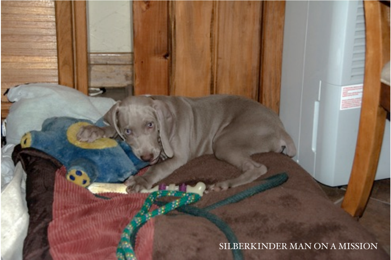
SILBERKINDER MAN ON A MISSION