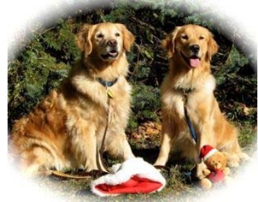
L - Golden Pine Oh Happy Day (Patti) CDX AX AXJ NFP NJP RAE CGC, age 13